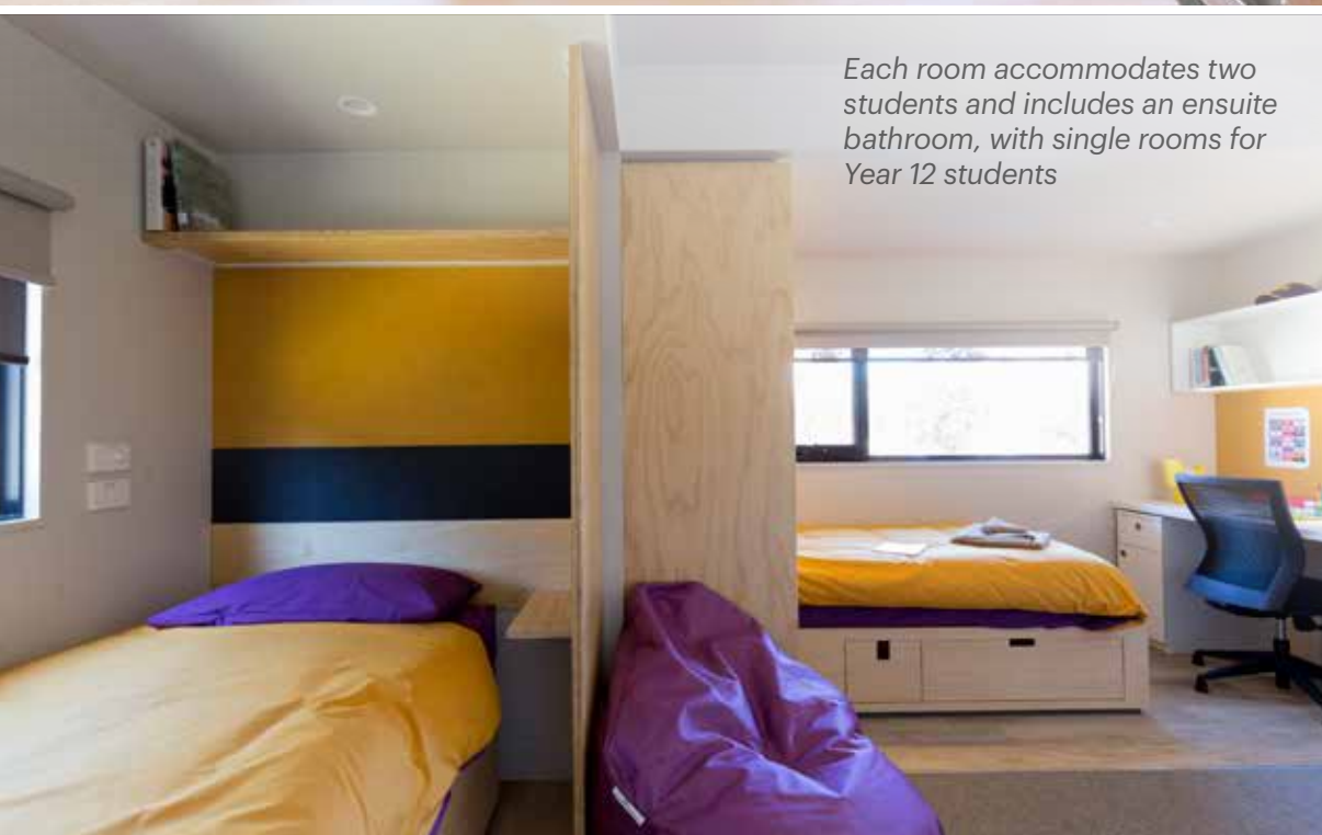
Each room accommodates two students and includes an ensuite bathroom, with single rooms for Year 12 students

Students have access to a communal dining space for breakfast, lunch and dinner. It seats 240 and adjoins the recreational area. Fresh, tasty and nutritious meals are always on the menu.