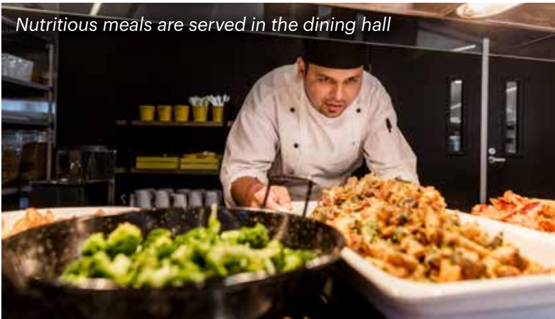
Nutritious meals are served in the dining hall