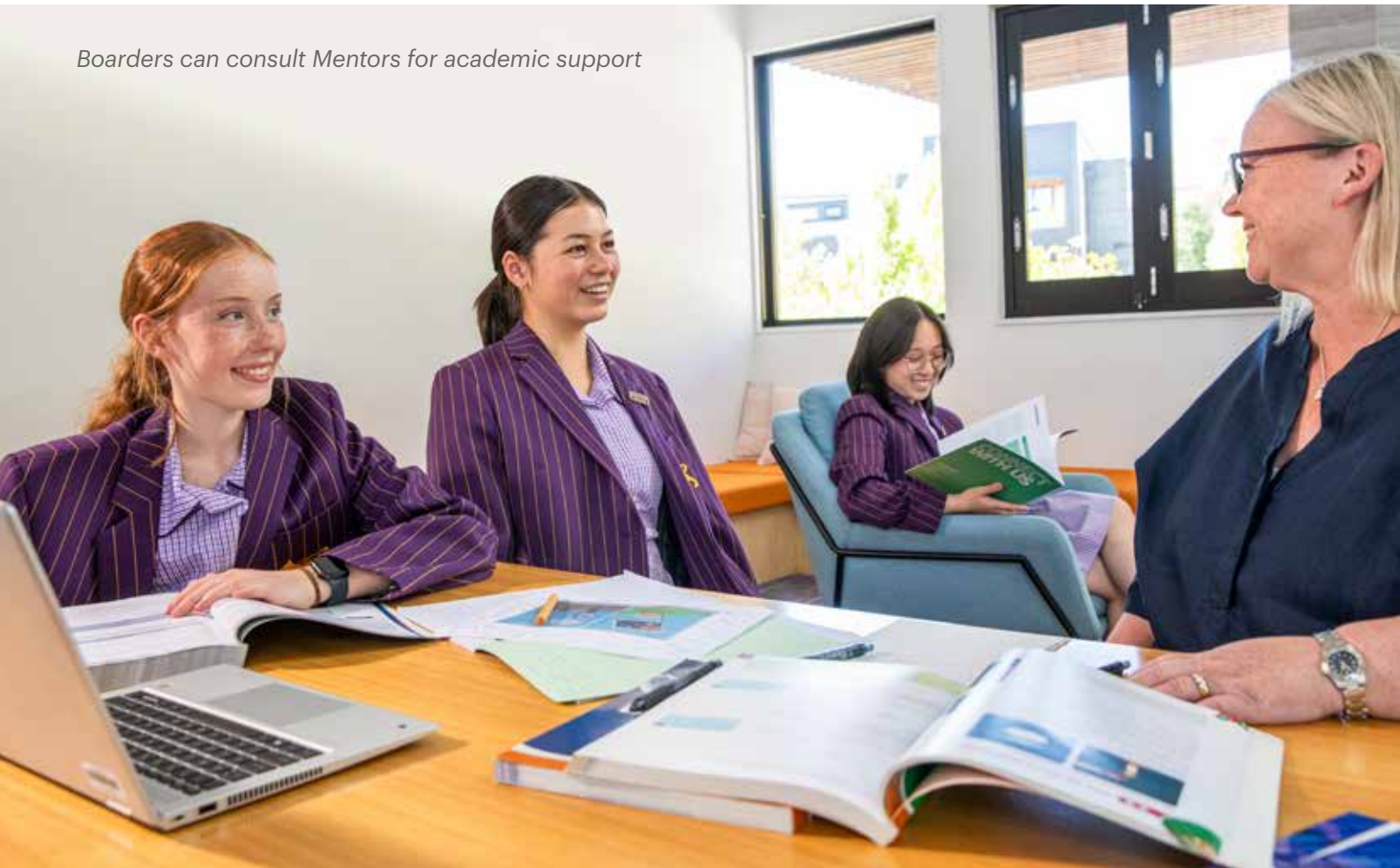
Boarders can consult Mentors for academic support