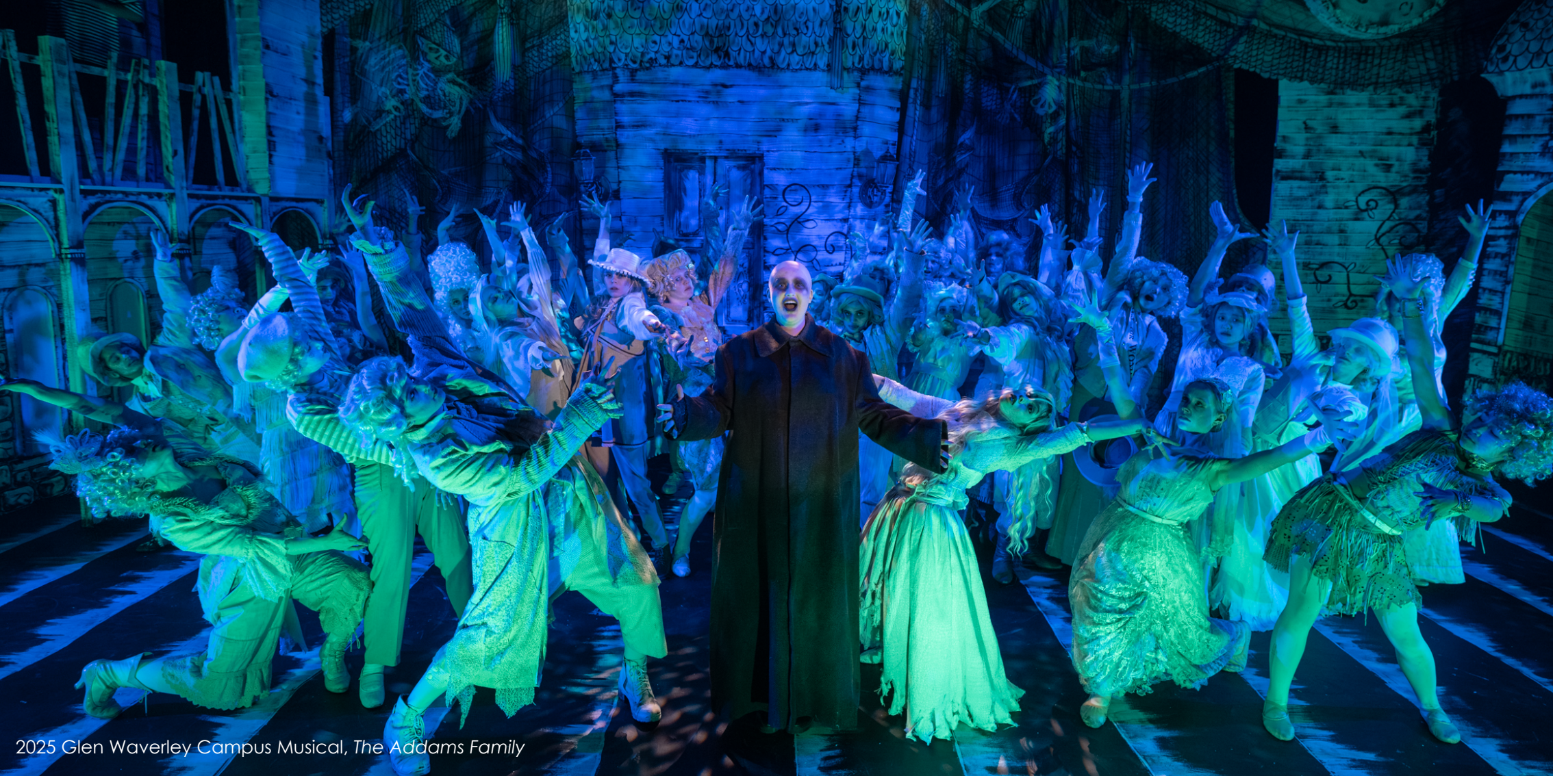
2025 Glen Waverley Campus Musical, The Addams Family