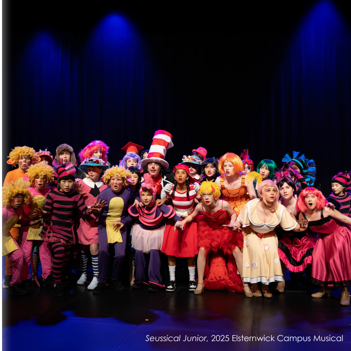
Seussical Junior , 2025 Elsternwick Campus Musical