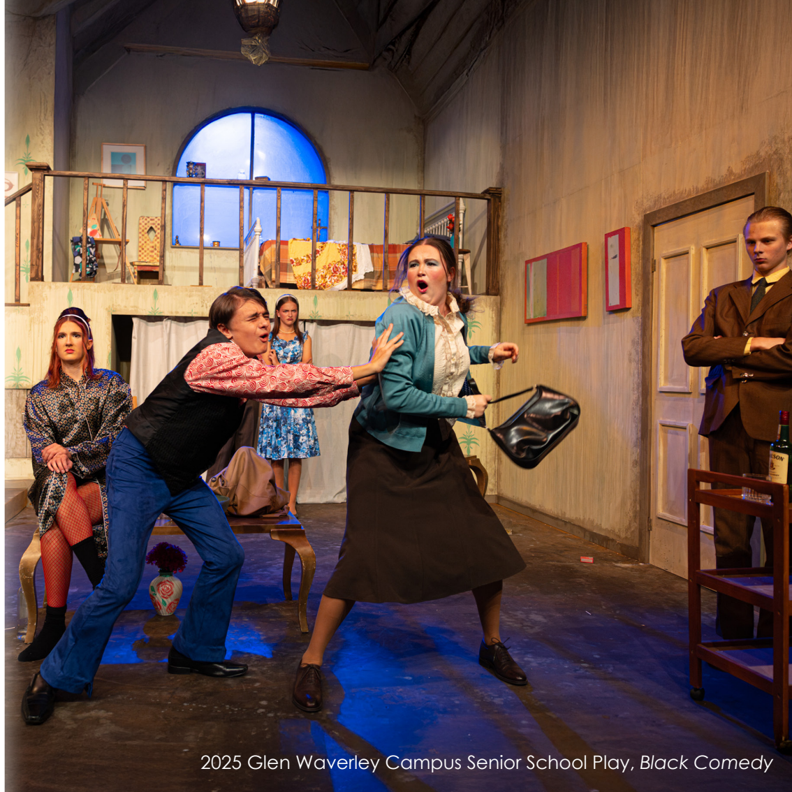
2025 Glen Waverley Campus Senior School Play, Black Comedy

This outstanding achievement reflects the passion, talent and teamwork of our students and staff who bring these stories to life and contribute so vibrantly to the youth performing arts community.