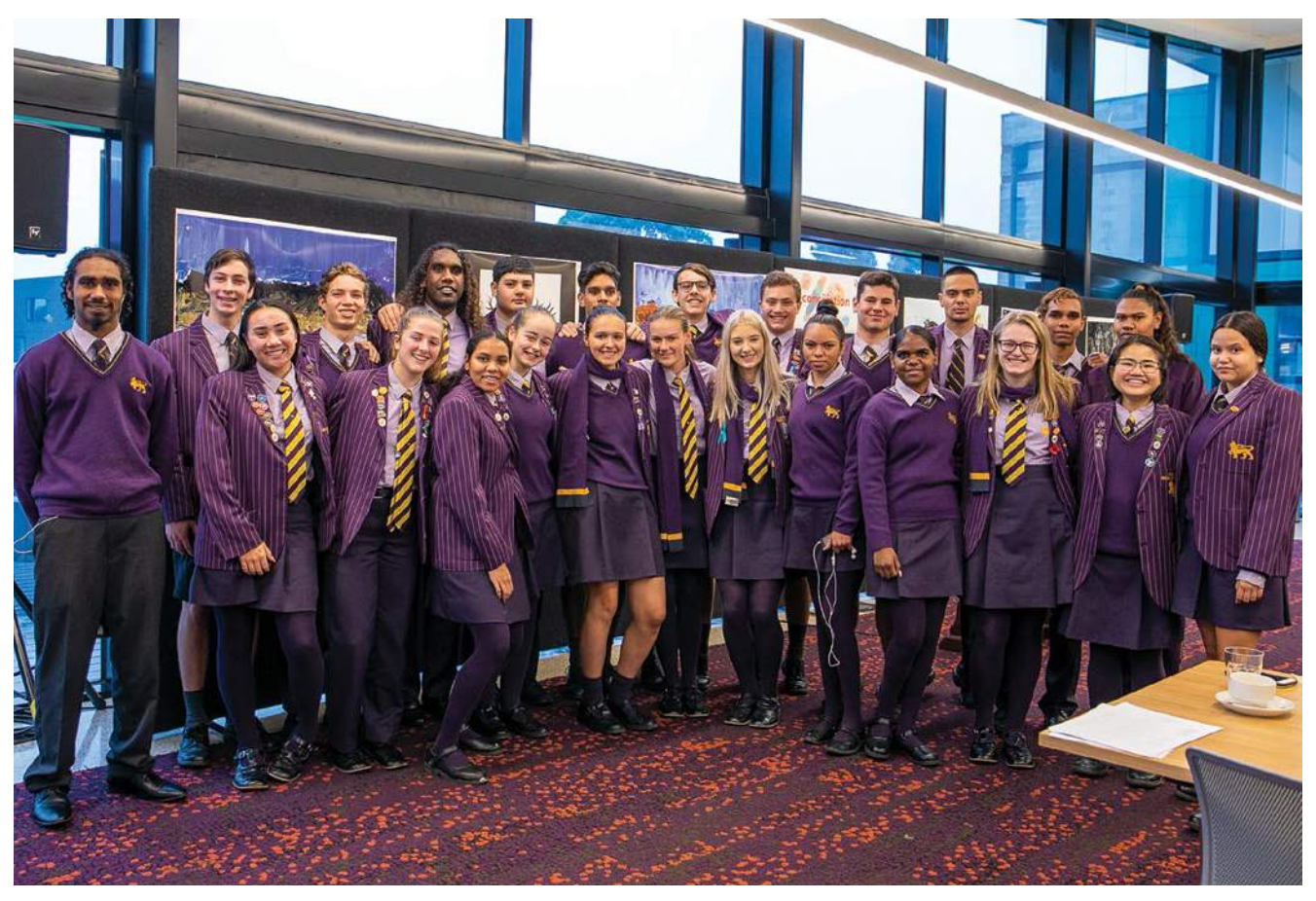
The impact of the Yiramalay/Wesley Studio School program on the learning and personal growth of students and others has been far reaching