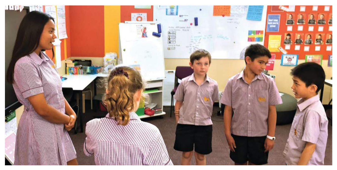
The Yiramalay/Wesley Studio School brings together students from many cultures to create positive change through education