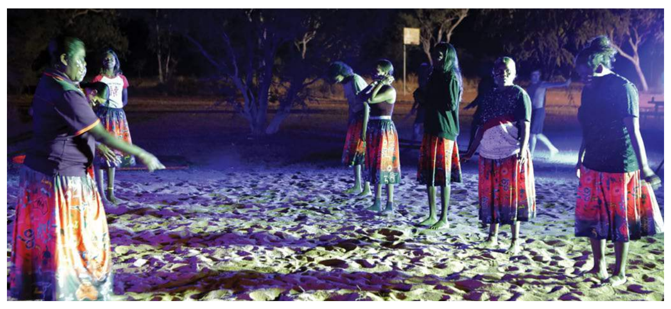
Teaching staff worked together to improve pedagogy and explore strategies for improving and enhancing engagement, including by making transdisciplinary connections using the eight-ways philosophy