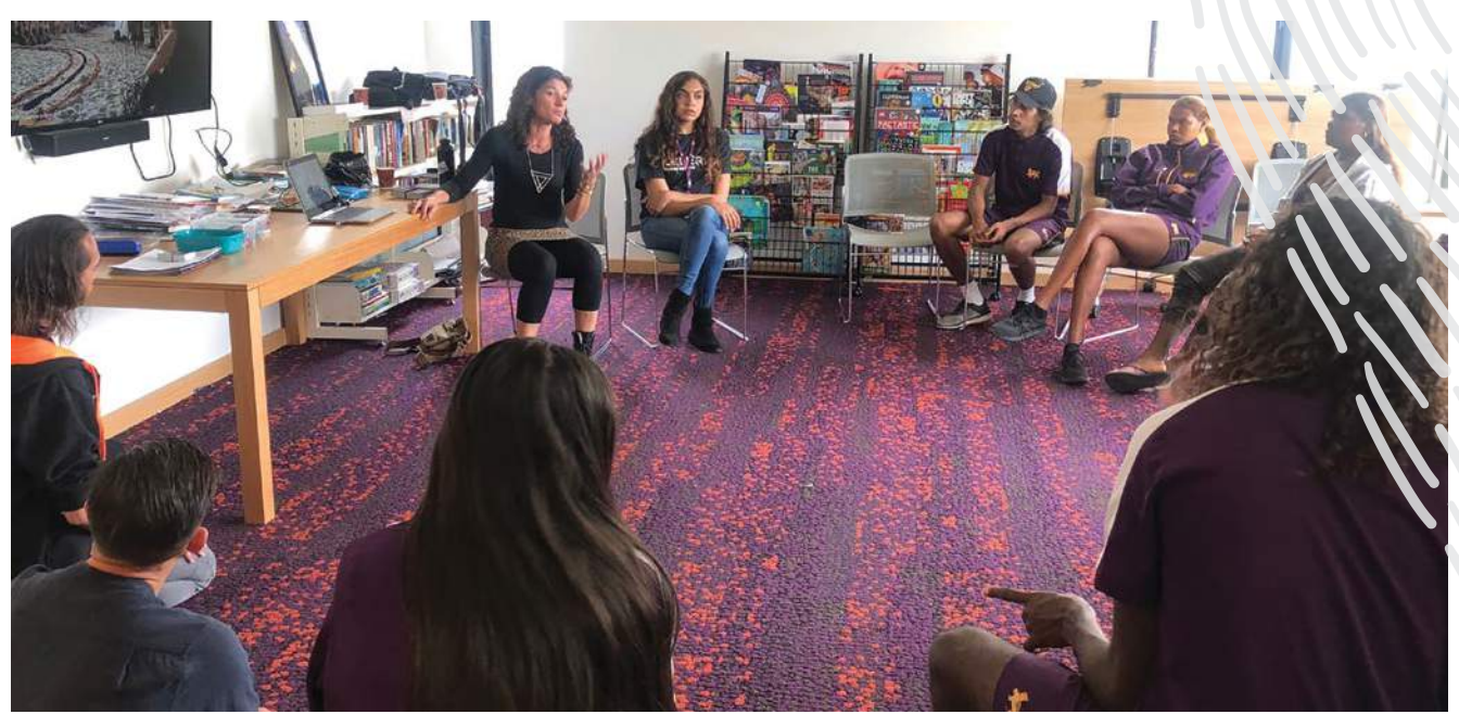
Yiramalay/Wesley Studio School students work with writers and actors from Ilbijerri Theatre

The learning framework for the Yiramalay/Wesley Studio School gives equal value to academic learning, hands-on practical industry learning, and personal/ social learning across cultures.