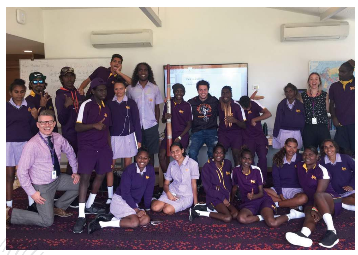
Staff worked tirelessly on enhancing curriculum offerings that are culturally sensitive and relevant

The Yiramalay/Wesley Studio School is located across two locations - one in the Kimberley in Western Australia, a unique part of the Australian continent, where aspects of traditional cultural life and Indigenous autonomy are possible and prominent, the other in Melbourne in an urban setting where Aboriginal culture is valued and celebrated within the context of Wesley College.